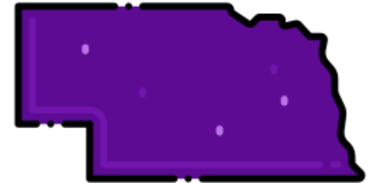
Independents and Democratic- leaning independents (one among women, one among men) in Omaha, Nebraska