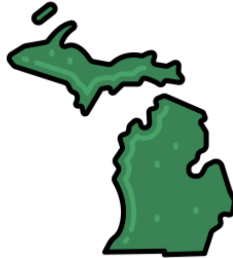
Soft Democrats in Detroit, Michigan